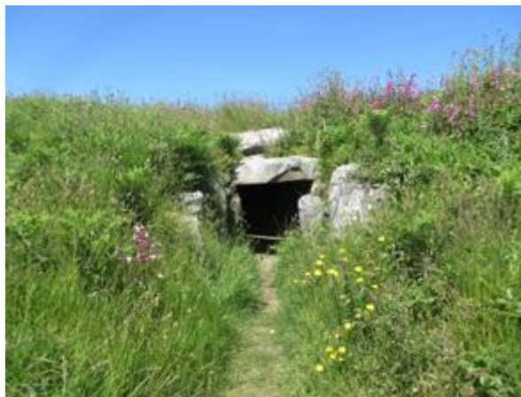
La Varde passage grave

The third site was a little harder to find and involved walking across the scrub grassland of the golf course (where no golfer wants to find his balls). Alan fearlessly walked across the course, while I nervously skulked around the edges whenever possible, but when we finally did come across La Varde tomb, what a cracker it was! To be precise, it was a passage grave and hailed as Guernsey's largest and most impressive surviving megalithic structure, built during the Neolithic period circa 4000 to 2500 BC and in use until the Late Bronze Age circa 1000 BC.