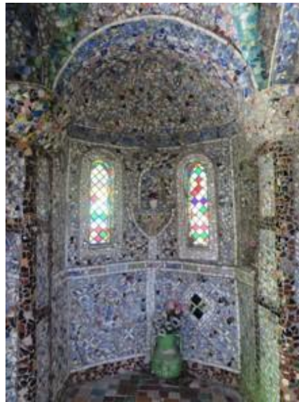
Inside the chapel