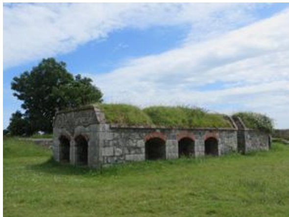
A living green roof?

Dating from 1780, this battery formed part of Fort George (named after King George III) that had been built during the French Revolution as a replacement for Castle Cornet in view of possible French invasion, protecting the seaward approaches - and there were some excellent sea views. After some alterations during the German Occupation, it became the headquarters of the German Luftwaffe radar early warning service. Originally named Terres Point Battery, it was renamed Clarence Battery in 1815 in honour of King George III's son Clarence.