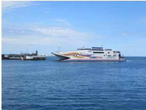
A boat eating ferry?

Back on the harbour front, the presumed art and craft festival was still in full swing, thronging with people (or possibly thronging with swinging people, I was a bit too tired to care). Suddenly as we passed by the stage, though, my attention was fully taken by a choir who had started to sing Old Man River - a song I hadn't heard for so many years and associated very strongly with childhood memories of my lovely dad, who used to sing it. A special moment ☺