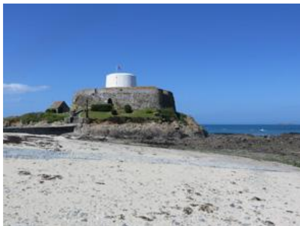
Fort Grey looking a little white

After that, we decided to walk to Fort Grey at the southern end of Rocquaine Bay. At first there were rural lanes and pleasant places, but then we came to a main road that ran around the bay. There was a fair bit of traffic and no pavement, which I hate. Whenever trucks or buses passed, we stopped and kept into the side of the road. I was very happy to reach Fort Grey!