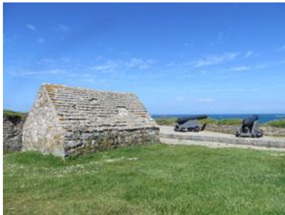
Magazine and cannons at Fort Pezeries

The wind had mostly dropped as we arrived at Fort Pezeries, where a fort had stood since at least 1680 to protect part of Rocquaine Bay below. During the 18 th century it had been extended and with the threat of French invasion in the 19 th century, more changes and strengthening had taken place. However, by 1842 the fort had fallen into disrepair, although in the Occupation, the Germans had built an earthwork machine gun position on the western wall. There was just no getting away from the German Occupation, but the fort's more distant affiliation to earlier conflict somehow felt better - or maybe the blue sky and the expansive sea view was helping to dispel any more recent wartime associations.