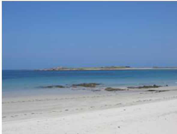
Beautiful lunchtime view at Vazon Bay

There was still time in the afternoon to visit somewhere else, so we consulted the much used Insight Guide and picked the Talbot Valley, which was on the way back to St Peter Port anyway. It was meant to be a steep sided valley where sandy-brown Guernsey cows grazed, where Guernsey's only working water mill could be found and then further along, a walk upward that would give a view over a peaceful and green part of undeveloped Guernsey.