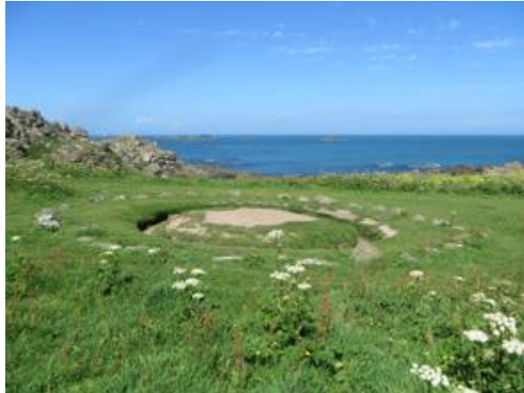
La Table des Pions

Hardly any distance away was a modern stone circle, if you consider the late 18 th or 19 th century not to be ancient. Its construction was linked to the Guernsey tradition of the Chevauchée, a procession that traversed the island every three years checking the condition of the roads. La Table des Pions was one of the many stopping points along the way, named because of the 'pions' (footmen of the officials on horseback) who sat there for refreshment.