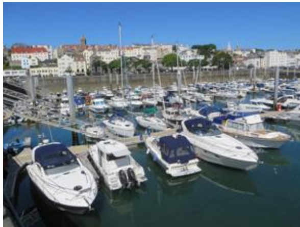
St Peter Port marina

Upon emerging once again into now bright sunlight along the harbour front, it was apparent that some sort of open air fair or festival was taking place, as the smell of frying doughnuts began to pervade the air in amongst various stalls selling numerous items. My best guess was that it was an art and craft fair, with even a stage being set up. There were already large numbers of people wandering around, so we decided to walk beyond the front and out past the side of the marina and the harbour to Castle Cornet on Castle Rock, a former tidal island connected to mainland Guernsey by a breakwater in 1859.