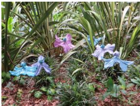
Drift by Carole Andrews

We spent a most relaxing hour and a half wandering through the subtropical woodland, hardly meeting any other people while perusing the many and varied plants and sculptures. I maintain that art is very subjective and while I admired and definitely connected with some of the sculptures, I must admit that others seemed just plain dodgy and unattractive to me. In fact, looking at sculptures feels a bit like looking inside someone else's mind - and to my mind, some people frankly seem disturbed!