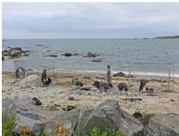
I really dug the beach dig

However, I did manage to sneak in a few surreptitious photos while Alan stood openly gazing down upon them - there were buckets, gloved people with hand tools, what looked like a finds tray and one man wheeling away the spoil in a wheelbarrow. It was just like a Guernsey episode of the dear departed Time Team!