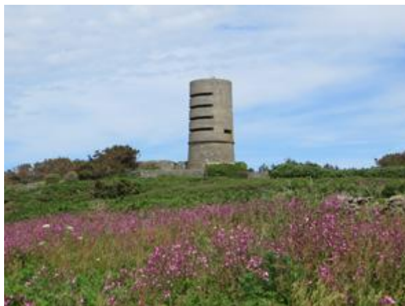
Reinforced concrete amid wildflowers

We continued our walk along the headland within constant sight of Fort Saumarez, named after Lord James Saumarez who defeated five attacking French frigates in 1794 with his ship HMS Crescent . Fort Saumarez had started life in 1804 as a Martello tower on the site of an existing battery (no longer there) after the Napoleonic wars had begun. During the Occupation, Germans built a four-storey reinforced concrete observation tower on top of the existing Martello tower, which remains in excellent condition because it was never battle tested. Excellent condition, but still a concrete reminder in more ways than one of a very difficult time.