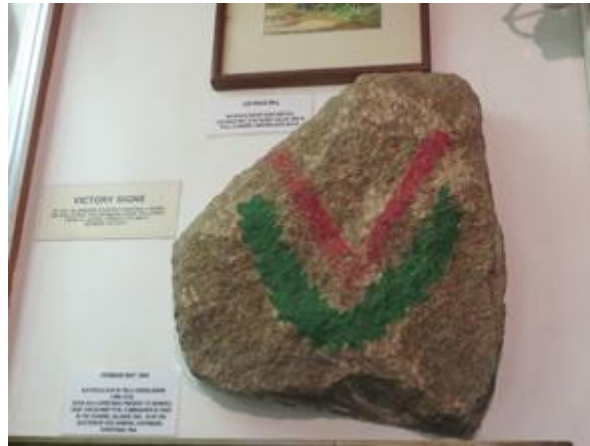
V for victory?

We emerged again into the still bright sunlight at 14:30, but since Alan was flagging, we simply drove back to Grange Lodge for some rest and relaxation - and a mug of tea, obviously. Pizza was enjoyed as an easy meal (they've all been easy) and a spot of Gardeners' World on television was relaxing too. It's hard to believe we've been here almost a week!