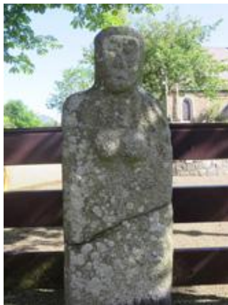
La Gran'mère du Chimquière