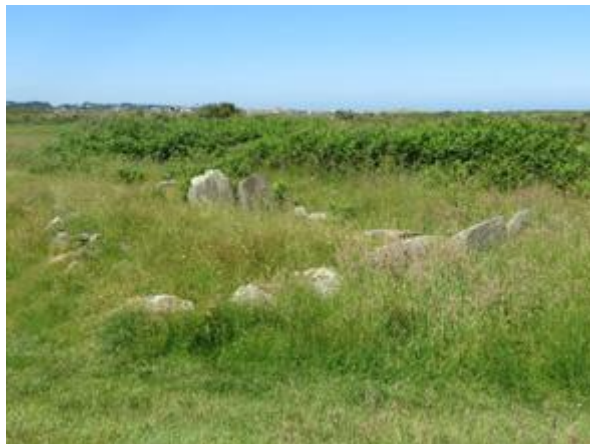
Les Fouillages nearly buried again

We were heading in the wrong direction, however, so had to retrace our steps to the car park and take a different direction along a path on the roadside edge of the golf course, before having no other choice but to traverse the actual golf course a little (slightly scary) in order to access the extremely ancient long mound of Les Fouillages.