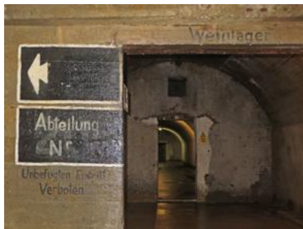
Wine storage - no unauthorised entry

The sound of dripping water was constant, with hundreds of straw stalactites forming on the ceiling and stumps of stalagmites forming on the ground. We wandered along the corridors, looking into various rooms, including wards with original metal beds and replica wooden beds. All the wards had been occupied by German soldiers wounded in D-Day battles and transported by ship from France, to be transferred above ground after a few weeks (if they made it). Some original German signs were still visible where they'd been painted on the walls.