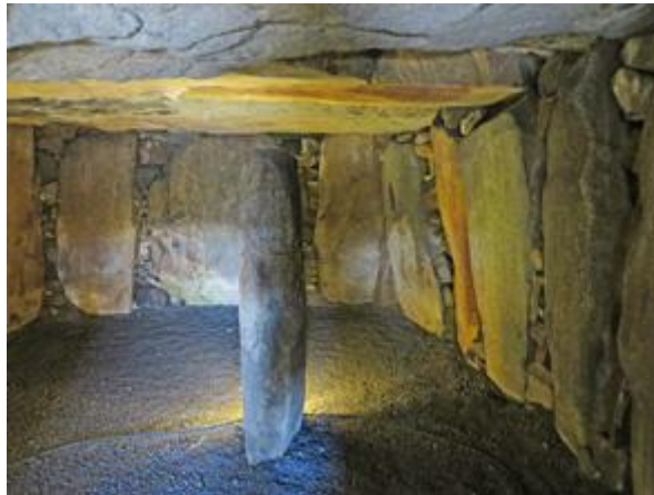
Le Déhus, but where is the guardian?

It was in good condition, having been excavated between 1837 and 1847, then re-excavated in 1932, with large quantities of finds dating from 3500 BC to 2000 BC. It owes its preservation in the first place to Sir John de Havilland, who purchased it for £4-10s-0d in 1775 to save it from destruction by local quarrymen. Well done, Sir John! It had the typical narrow entrance leading into a broad chamber with side chambers - four of them, although apparently one had been re-created in error.