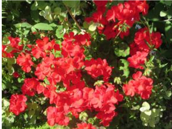
Rebellious red delight in the sun

We made our way back to Grange Lodge along the hot streets and I can't deny I was tiring rapidly towards the end, although it only took about 15-20 minutes. A refreshing cold drink helped greatly and then we had simple but good cheese sandwiches and crisps for lunch.