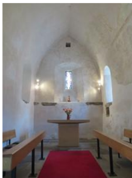
The simply beautiful chapel

In due course we arrived back at the car and so it was time to return to St Apolline's Chapel, where we were happy to see the single allotted parking space was free. The single-cell building thought to be the only remaining medieval chantry chapel in Guernsey was also free and as we entered to the lingering smell of the candle used in the service, a sense of calm pervaded.