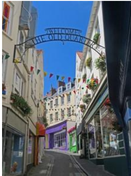
Not half quiet in the old quarter

It was quieter in the old part of town, otherwise known as The Old Quarter. In between looking in shop windows, we noticed some fine old buildings that seemed as if they could tell quite a story of Guernsey's history. The time passed quickly until midday, when we had to decide what to do for lunch. Since Alan was at the coughing and nose blowing stage, it didn't seem a good idea to go in anywhere to eat, so we moseyed along to Pasty Presto to buy ... a pasty! There were no vegetable ones, so we settled for cheese and onion, which was no hardship.