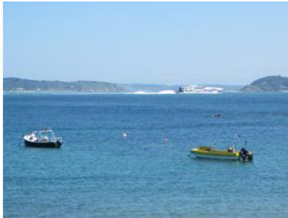
El Condor pasa...

We had no other choice than to walk back along the 'public footpath' to the car park, before deciding to take another coastal path that seemed to lead only into one of St Sampson's industrial areas. However, at least there was a pretty good sea view of Herm, Jethou and Sark, plus some ferns and colourful flowers along the edges of the path. We then enjoyed 15 minutes or so sitting on a wooden bench looking out to sea - especially when the Condor high speed catamaran came motoring along with a massive wake and passed in front of Herm opposite us, perfectly placed for some quick snap photos!