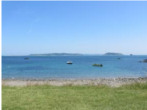
Banque Imbert Bay