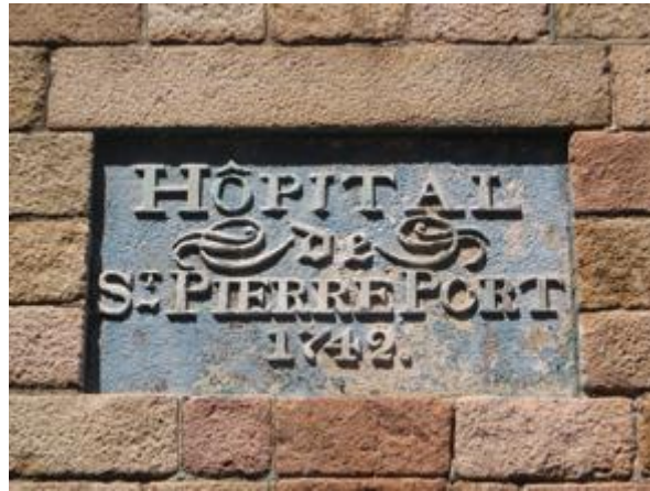
The old House of Charity

Down among the shops in the town, so many people were thronging the streets that we left the madding crowd for the harbour, stopping to take photos of an old 'barrière' or boundary stone (one of several that mark out the extent of the medieval town), a blue post box and a stone marking the place where the British liberating forces landed on 9 th May 1945.