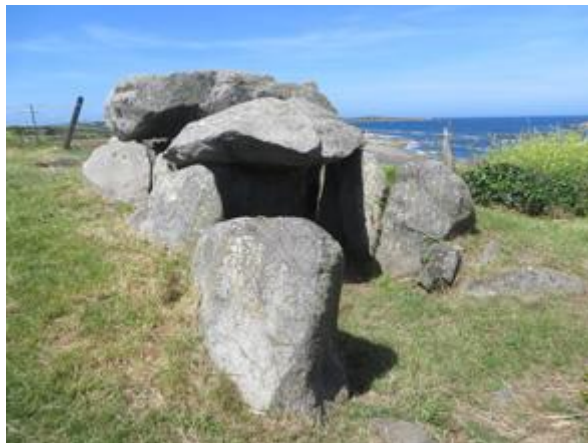
Le Trépied dolmen

It was working well, when one of the adults with the group came down to tell us they had a guide with them up at the dolmen, a lady who specialised in the island's history and whose tours and talks were well acclaimed. If we wanted to listen in at the edge of the group, we would be welcome - and since it would have seemed rude not to accept, we joined them!