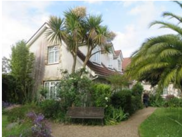
Welcomed by a lovely garden

There was soon ample compensation for this difficulty, though, when we took possession of the key and started the process of carrying our luggage from the car to the apartment. The compensation was in the form of a lovely garden, with mature palm trees, grassed areas and plants and shrubs of many kinds, including tall flowering rose bushes in front of the windows. It was a very well tended garden and the cares of the journey immediately began to fall away.