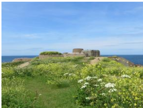
Fort Hommet amid the wild mustard

Afterwards, we walked from the car park along to Vazon headland, described as having rich habitats, including stabilised sand dune, wet meadow and heathland. Unsurprisingly, it was an area where rare species of plants, butterflies and birds thrive. We did see an unusual pinkish ground hugging flower we couldn't identify, as well as the newly identified tree mallow and common mallow, but apart from that the headland was awash with the usual wild mustard.