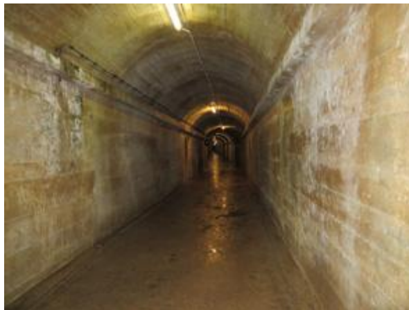
One of the lighter corridors

The Insight Guide wasn't wrong! The idea was the same and the dark, dank tunnels were the same, but it somehow felt more extreme in its desperate attempt to win the war at the expense of human suffering. There were few exhibits in the individual tunnelled out wards, corridors and rooms, but mostly it was a dark, dripping underground labyrinth of despair. The mortuary conveyed it all with its tangible shadowy gloom of death.