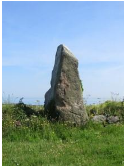
A standing stone, but is it a menhir?