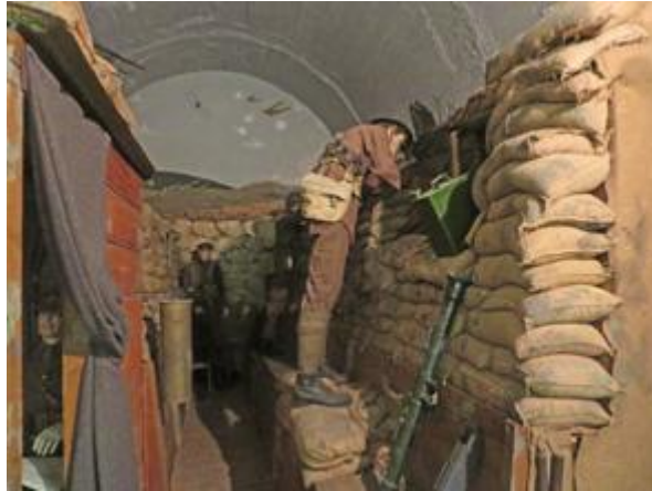
Scene from a World War One trench

There were so many exhibits that I began to feel a bit exhibit-blind and slightly overwhelmed, but it was a really good museum for an insight into life in occupied Guernsey. There was even a photo of a German officer outside Grange Lodge, which had been used as headquarters for the German Feldkommandant during the Occupation. The amount of memorabilia was amazing and there were even military collectibles for sale. A rare place, if not a little disorganised.