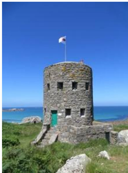
"Nid de l'Herbe" - nest of grass?

We continued onwards and upwards at that point to another tower that had a chimney, a green painted door and a flag flying gaily from its roof. It was privately owned and called "Nid de l'Herbe" - L'Ancrese Tower number 5. It must have had an excellent view of the bay and unlike towers 6 and 7, it wasn't acting as a dovecote for pigeons - a pigeoncote?