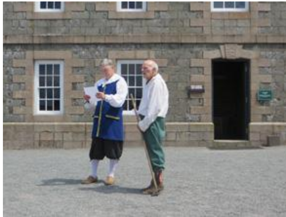
17 th century drama

When England's civil wars began in 1642, Guernsey sided with parliament, while Guernsey's governor sided with the king and fled to Castle Cornet. Meanwhile, John Lambert from Yorkshire was a Parliamentarian and did very well for himself, being promoted to Major-General and considered by many to be Cromwell's successor. However, following the restoration of the monarchy in 1660, he was considered to be a threat and in 1661 ended up as a prisoner in Castle Cornet, although he was allowed a great deal of liberty.