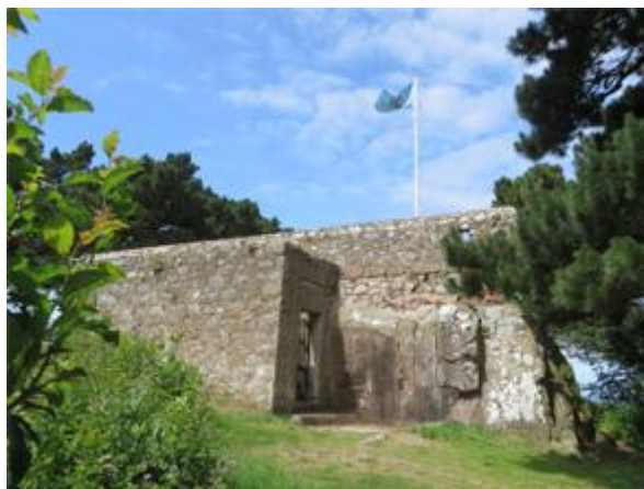
Rocque du Guet watch-house and battery

After a very short drive, we set off to find some steps to the top of a wooded quarry, but realised we must have missed the steps when we found ourselves walking up a residential road. Alan fortunately had his wits and his sense of direction about him and after noticing a narrow country lane up through some houses that we investigated, he spotted the watch-house and battery high on a wooded hill. To reach it meant scrabbling up a steep slope into the wood, but it was a pine wood and pine needles made the ground easier and more pleasant.