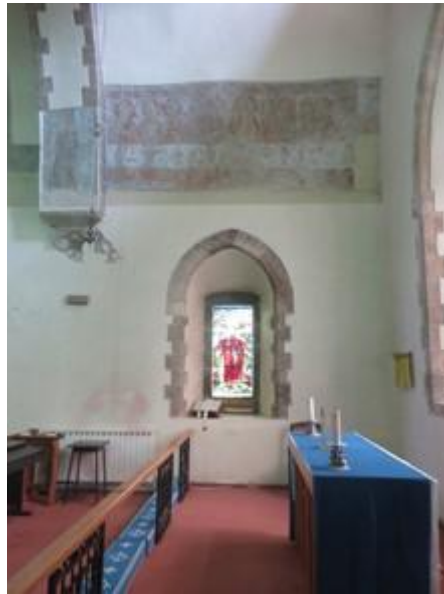
Part of the 13 th century fresco