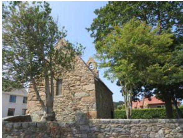
Nearly mown down outside St Apolline's Chapel!

I reluctantly left the small but sympathetically restored haven and joined Alan outside to take some photos of the exterior - where we were both nearly mown down by a lorry that suddenly turned the corner and drove down the narrow road where we were standing. It was a bit of a shock after the chapel's interior tranquillity, but after breathing in hard and attempting to melt into the wall behind, we lived to expostulate about lorry drivers and Guernsey narrow roads!