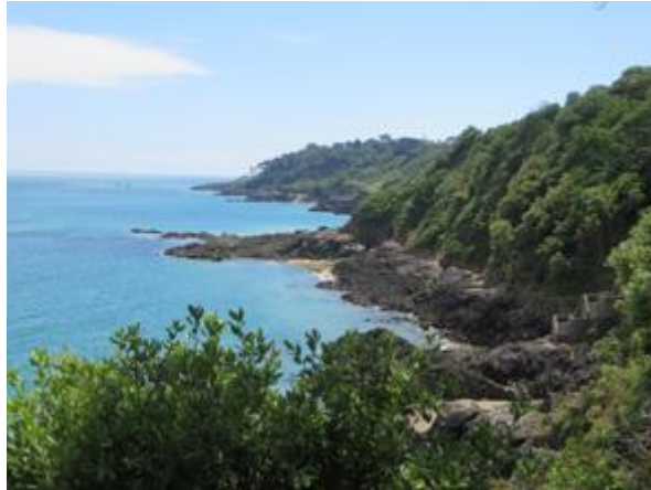
Fermain Bay was far enough

After taking some steps leading down to the coastal path again, we carried on for a while until we could look out over Fermain Bay and the 88 Ozanne Steps. These steps had been built by a former governor of Guernsey to give access to a rock platform so he and his wife could bathe in privacy, which seems quite a step (or 88) to take, unless they were closet skinny dippers.